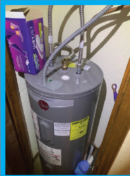
Hot Water Heater Spill Pan