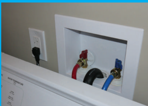
Washing Machine Connections