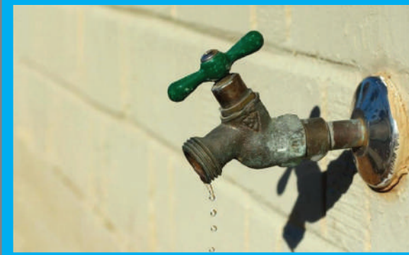
Outdoor Hose Bibs