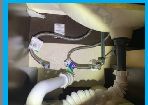
Under Cabinet Sink Connections