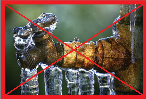
Non-Insulated Hose Bibs can Freeze

During our colder Texas months, we recommend that you winterize your home by protecting pipes and fixtures from freezing. Fixtures inside your home that are located on exterior walls should be dripped and cabinet doors opened to help prevent freezing from occurring. Exterior pipes exposed to the weather should be insulated properly.