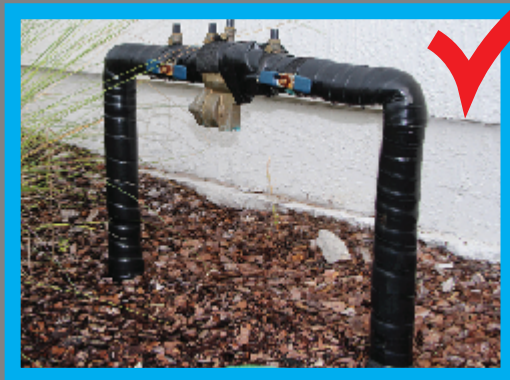
Insulate Irrigation Pipes

Care should be given not to expose chemicals to children or to pets