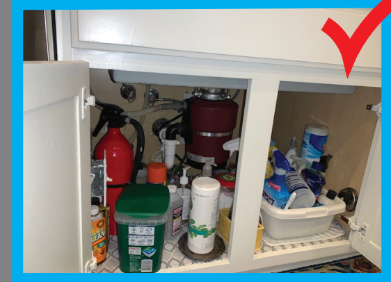
Open Sink Cabinet Doors on Exterior Walls

Care should be given not to expose chemicals to children or to pets