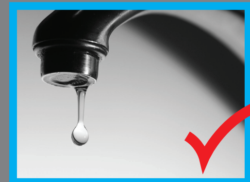
Drip Interior fixtures on Exterior Walls