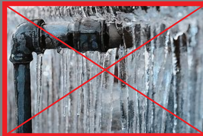
Non-Insulated Pipes can Freeze and Burst